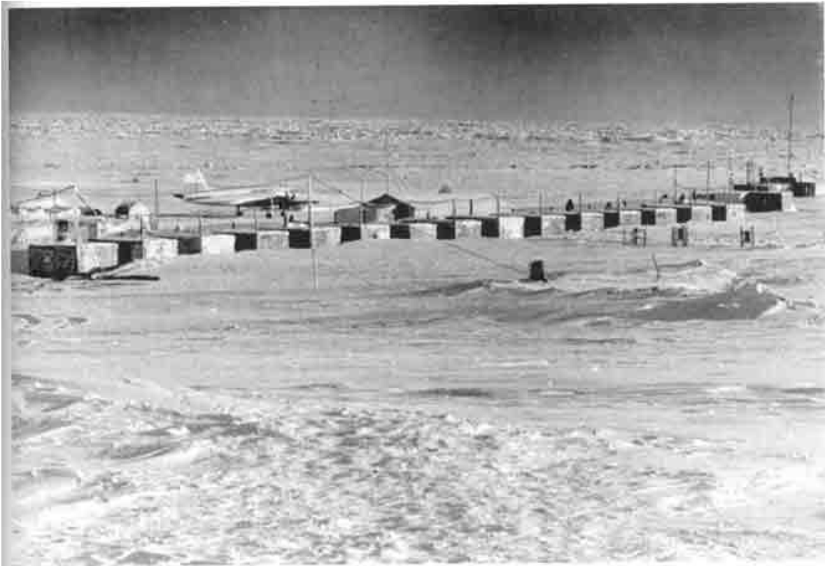
Фото 58. База ВВЭ «Север» на о. Жохова

Figure 3. High-latitude expedition Sever base on Zhokhov Island.