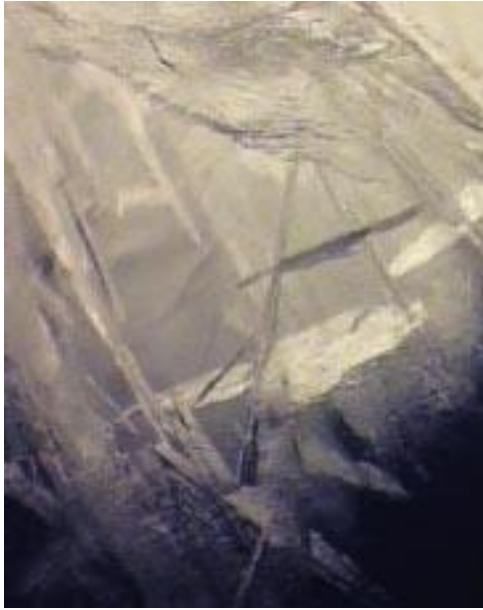
Figure 2: Screenshot of sub-ice platelet layer video recording