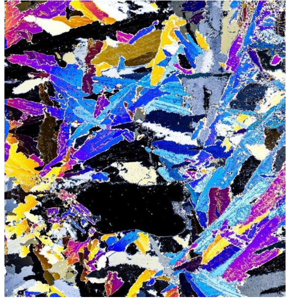
Figure 3: Thin section of incorporated platelet ice