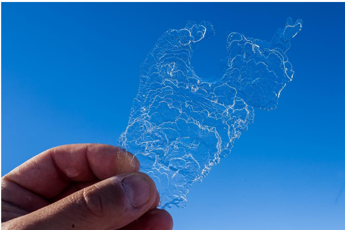
Figure 1: Photo of individual platelet crystal

With kind regards, the "platelet ice team".